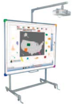
Adjustit II Stand